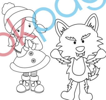
Little Red Riding Hood

The wolf fell down the chimney. Then the three little pigs