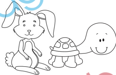
The Tortoise and the Hare

Goldilocks ran out of the house as fast as she could. Then the three bears