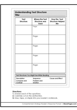
Understanding Text Structure