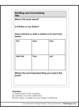
Retelling and Summarizing