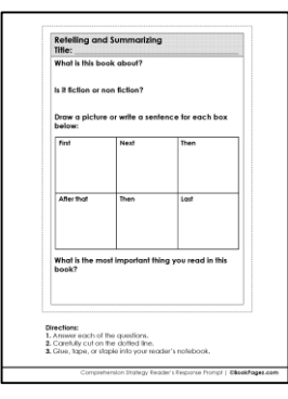
Retelling and Summarizing