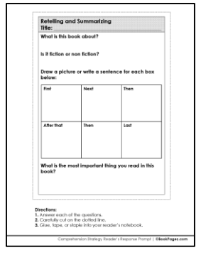
Retelling and Summarizing