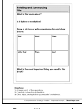
Retelling and Summarizing